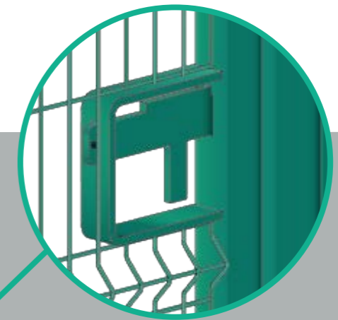
Padlockable Slide Bolt Detail