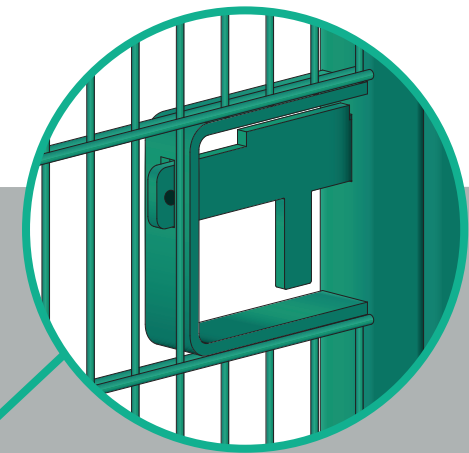
Padlockable Slide Bolt Detail