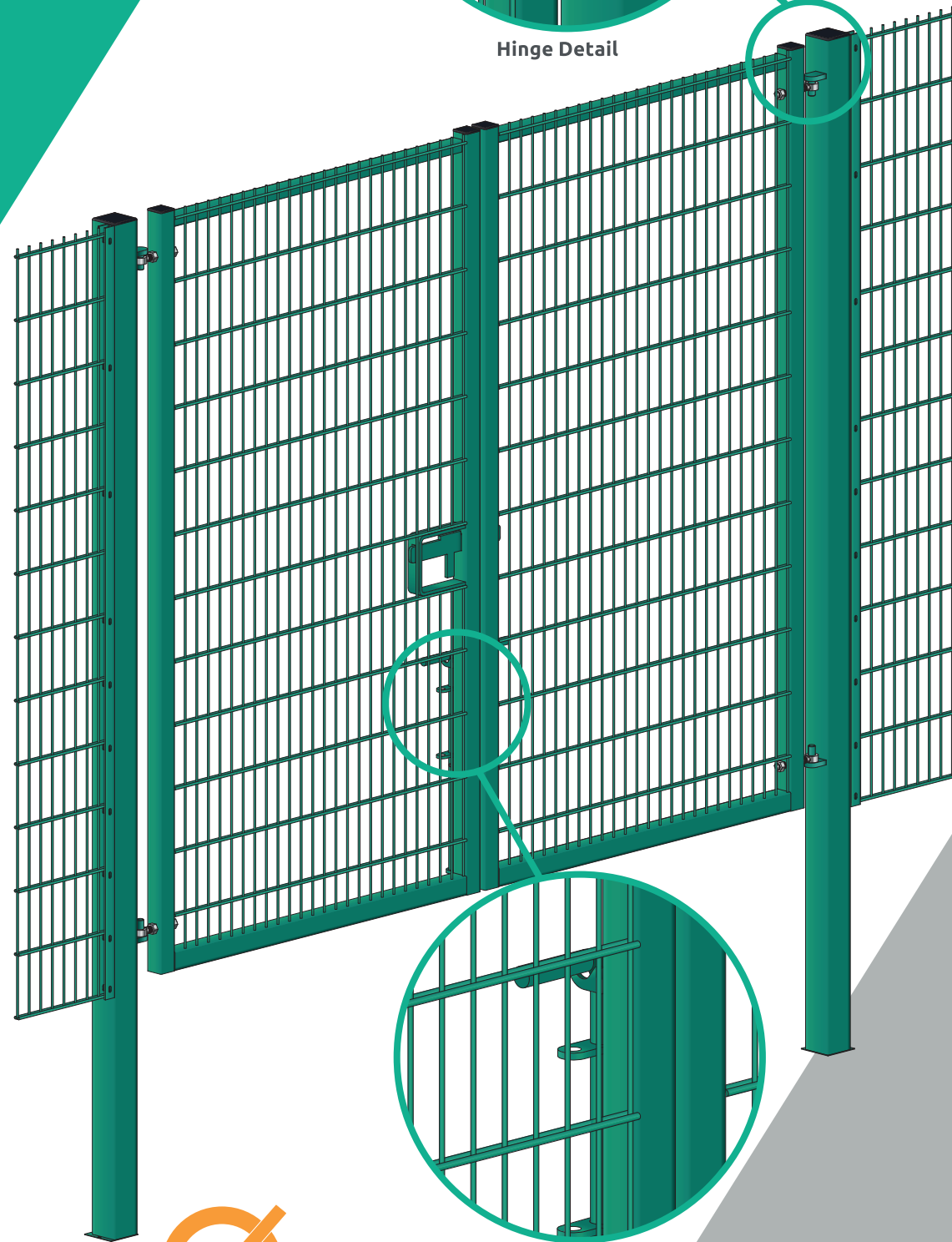
Padlockable Drop Bolt Detail