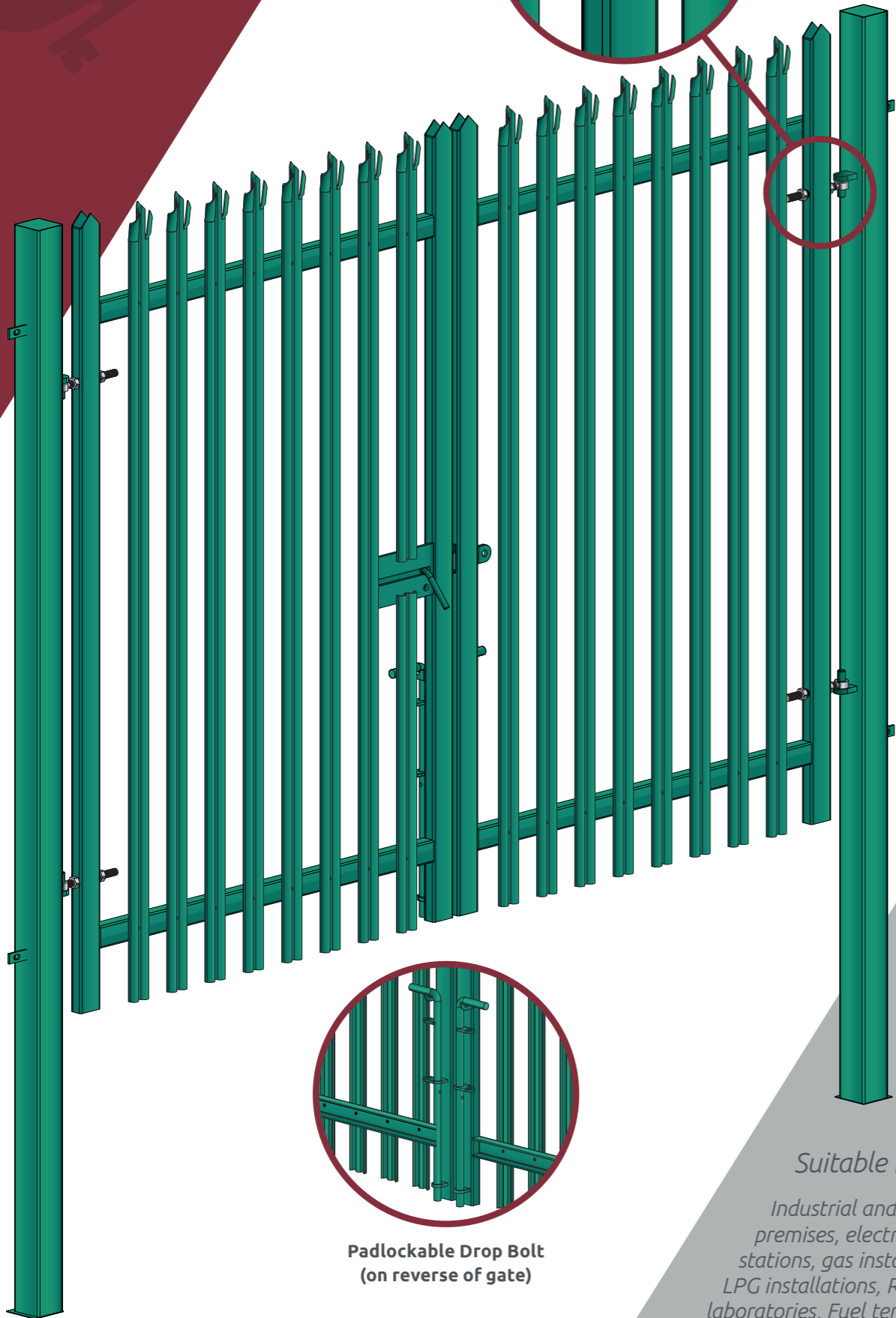
Padlockable Drop Bolt (on reverse of gate)

Please refer to our Palisade specification sheet for details on the range of pale styles. Rotating Anti-Climb and Razor Wire can be fitted with bolt on brackets for additional security.