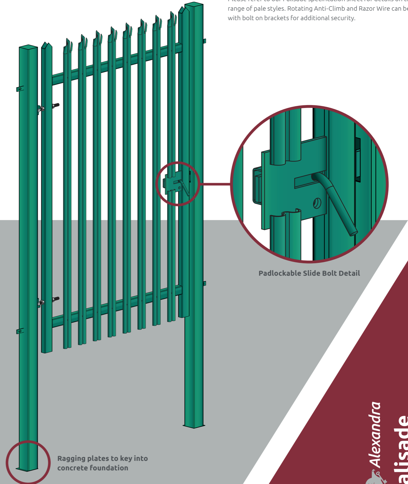
Padlockable Slide Bolt Detail

Industrial and commercial premises, electricity sub stations, gas installations, LPG installations, Research laboratories, Fuel terminals, Data centres, Sewage and water treatment plants, Railways and motorways, Police stations and courts.