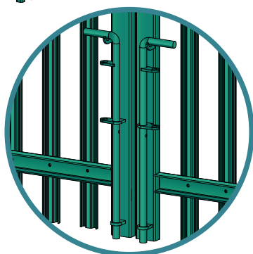
Padlockable Drop Bolt (on reverse of gate)