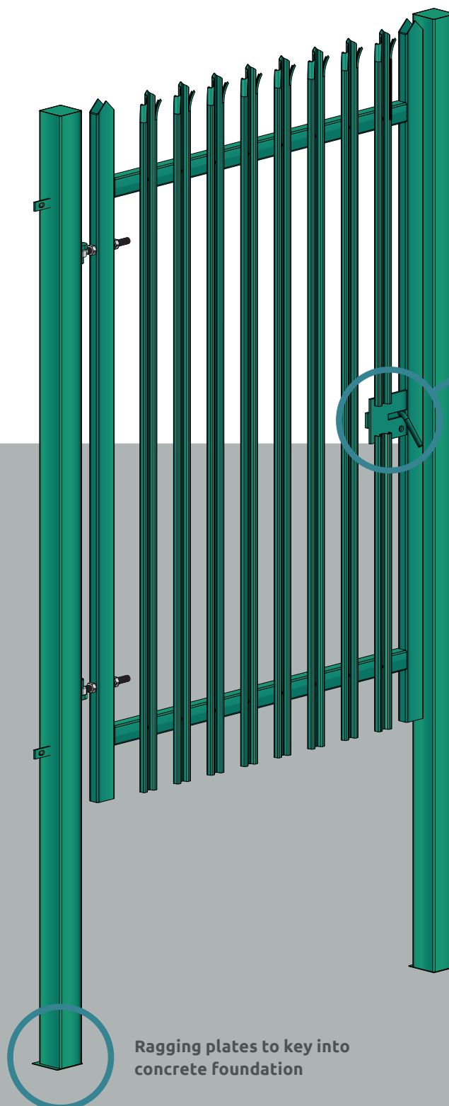
Ragging plates to key into concrete foundation

For more details on this product please visit our website: www.alexandrasecurity.com